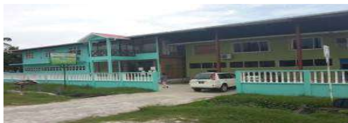
Doobay Medical Research Centre