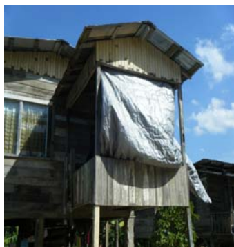
Houses in Canal area