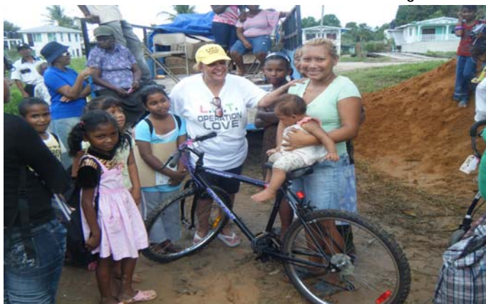
A woman receiving bicycle for her husband. Her house (shack) was burnt to the ground -- they had nothing. We were able to assist with clothing, toys for the children and of course the cycle which will help the husband to get to work

Volunteers and supporters help us to deliver much needed services to the needy in Guyana. Without you – our supporters/volunteers and members, we would not be able to provide assistance to as many people. By volunteering it makes a difference, either as a regular volunteer or as a volunteer on a special project, you too can make a difference! This is a chance to give something back to the community, use your skills and experience in ways that make a change in the lives of people who need their help. For others, it is a chance to meet new friends and be supportive -- it is a rich and rewarding experience.