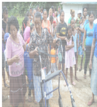
A woman accepting a Walker for her disabled daughter