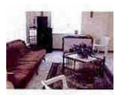
The boys' living room

Part of our help is focused on the youths of Guyana, since they will be the future leaders who will help to develop Guyana and its rich resources. We highlight below two of the charities we assist and would appreciate your help to support the work that they do.