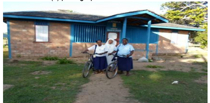
In front of the convent.

Below are two (2) photographs with notes: