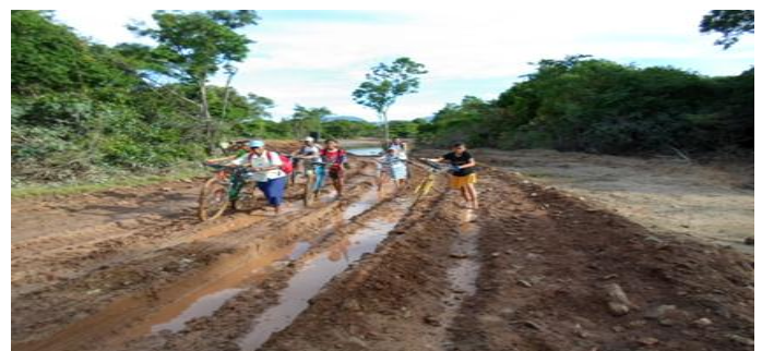
Some of the road they have to go through – but we understand that others are better!